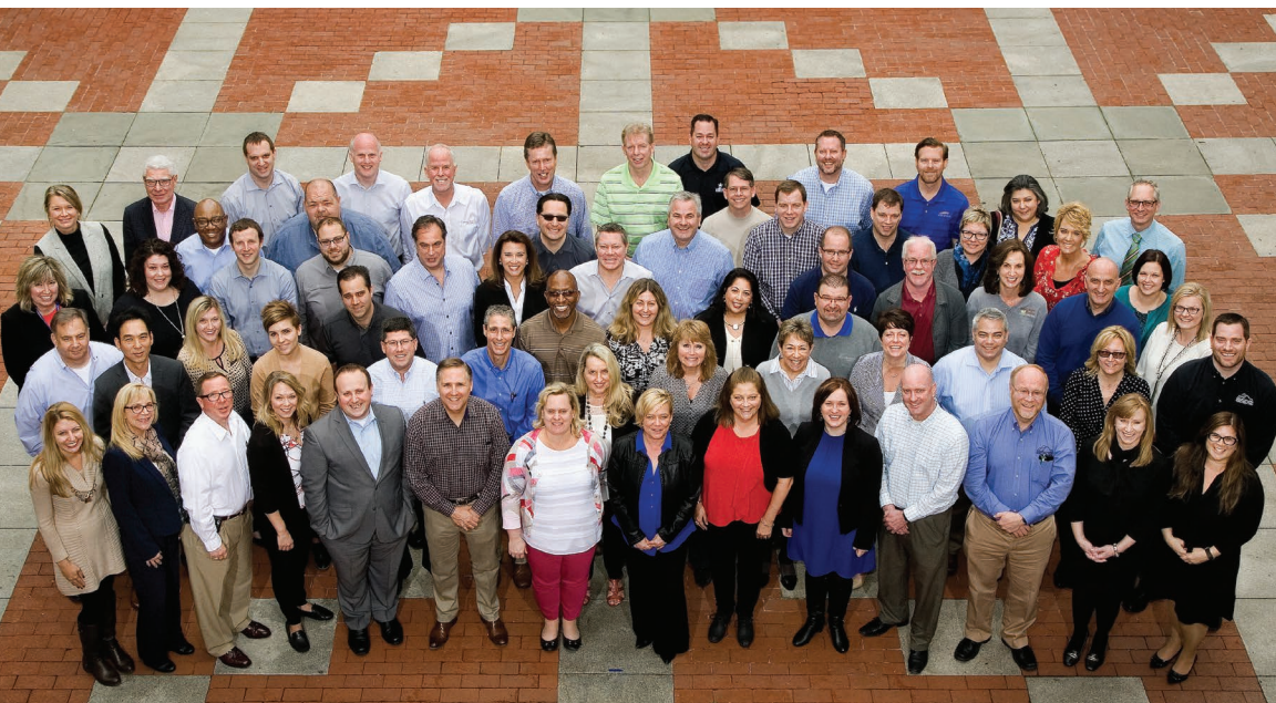
CEO Institute I: Strategic Planning , Class of 2017

when you have completed all three weeks of CEO Institute and two between segment assignments.